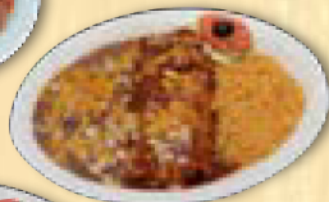
Chile Verde Burrito