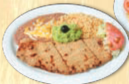
Milanesa de Res

Beef tongue sautéed with onions, bell peppers, cilantro, and tomatoes 22.99