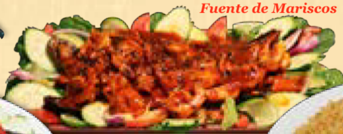
Fuente de Mariscos