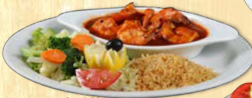
Camarones a la Diabla