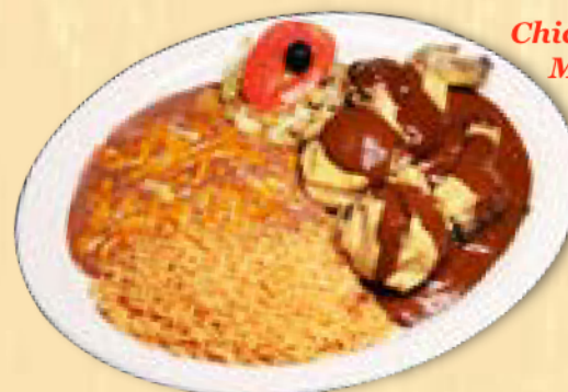
Chicken & Mole

Tender Pork chunks served with cilantro, guacamole, and tomatillo sauce 17.99