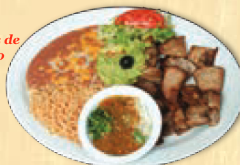
Carnitas de Puerco