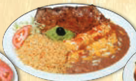
Carne Asada a la Tampiqueña