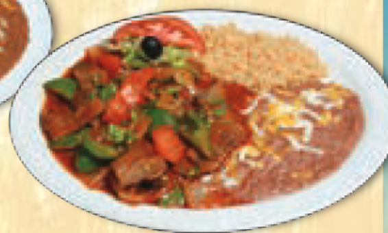
Lengua en Salsa