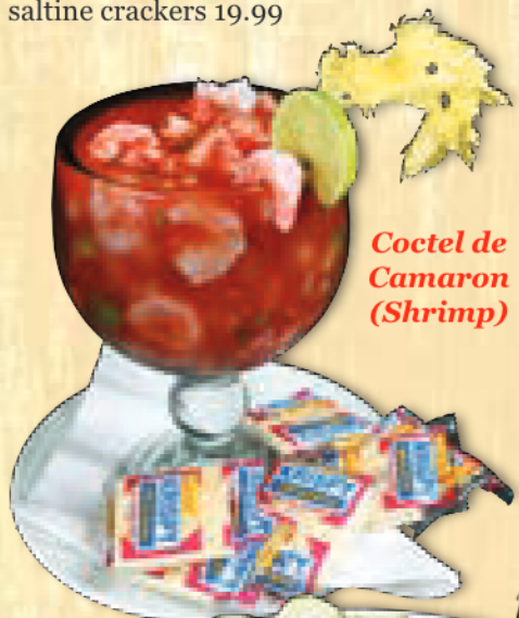
Coctel de Camaron (Shrimp)

A seafood cocktail prepared with onions, tomatoes, cucumbers, cilantro, and avocado. Choice of tostadas or saltine crackers 19.99