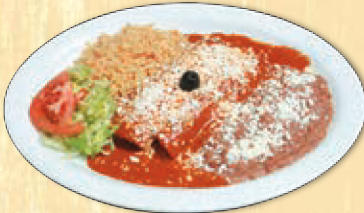
Enchiladas de Mole